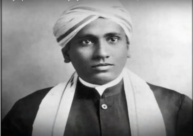
C. V. RAMAN (7 NOVEMBER 1888 – 21 NOVEMBER 1970) Physicist and Nobel Prize Laureate