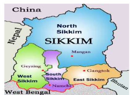
State - Sikkim