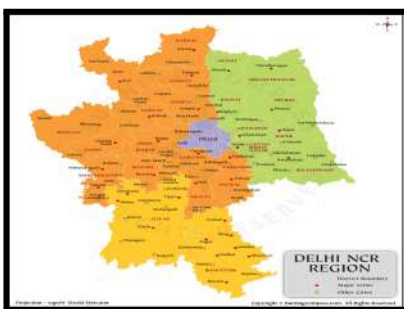
State - Delhi