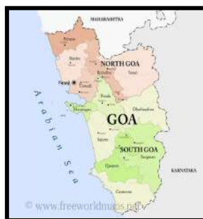
State - Goa